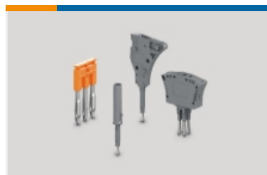
Terminal Block &amp; Strip Conducting Accessories(67)