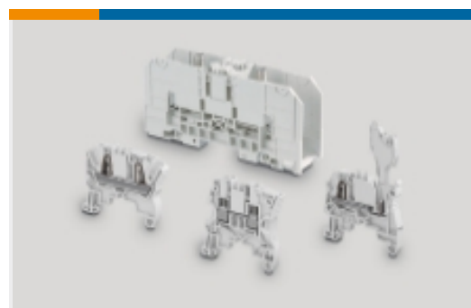
Modular Terminal Blocks(318)